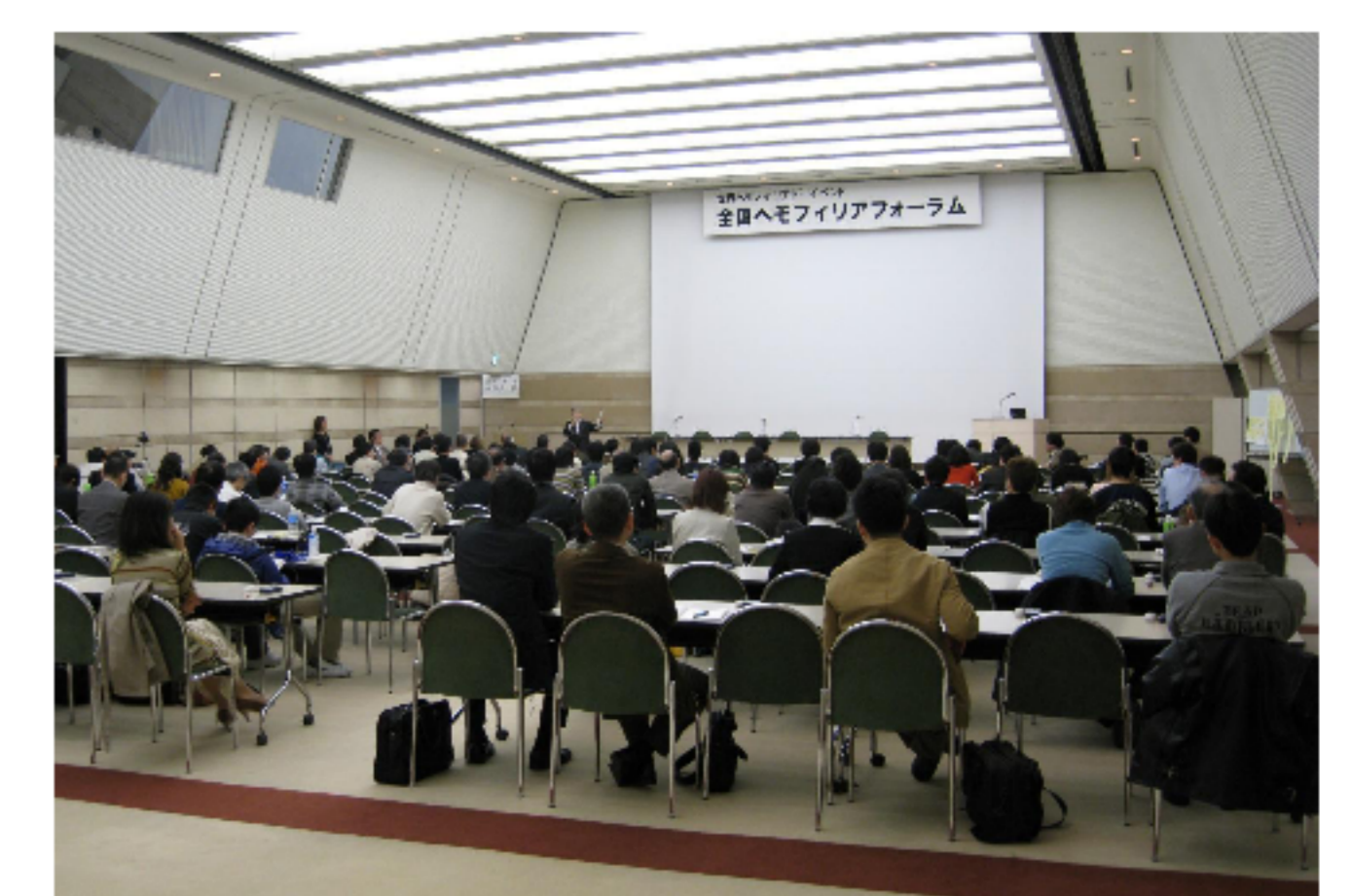
The nationwide hemophilia event held for the first time in a couple of decades.