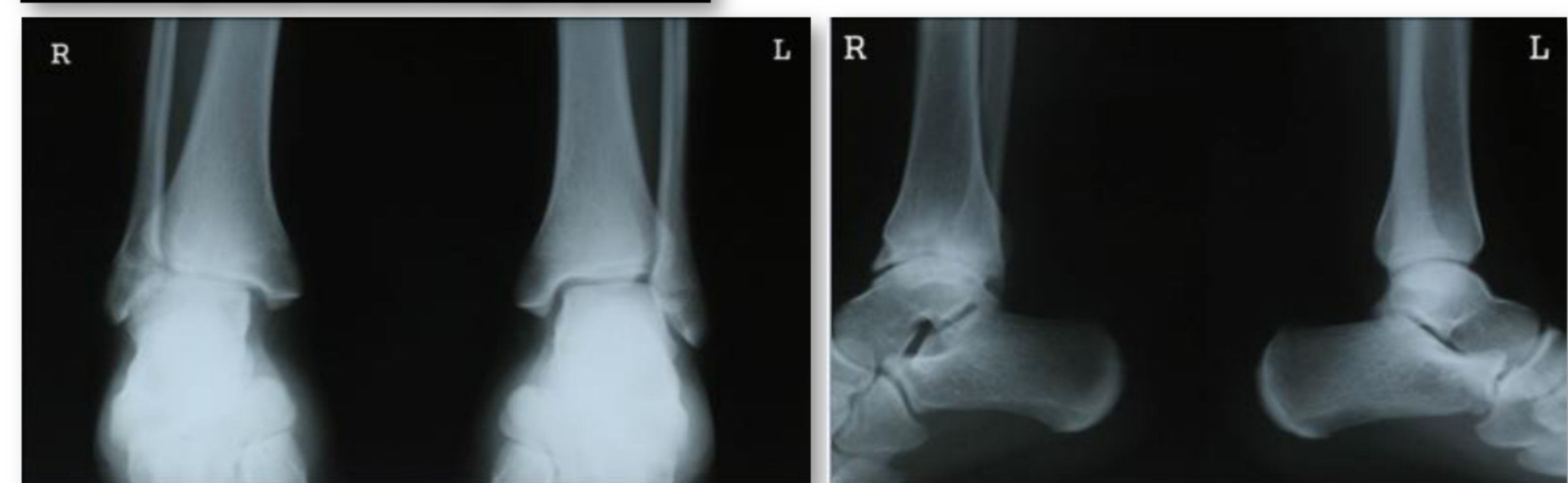
Late prophylaxis (Ankle AP)