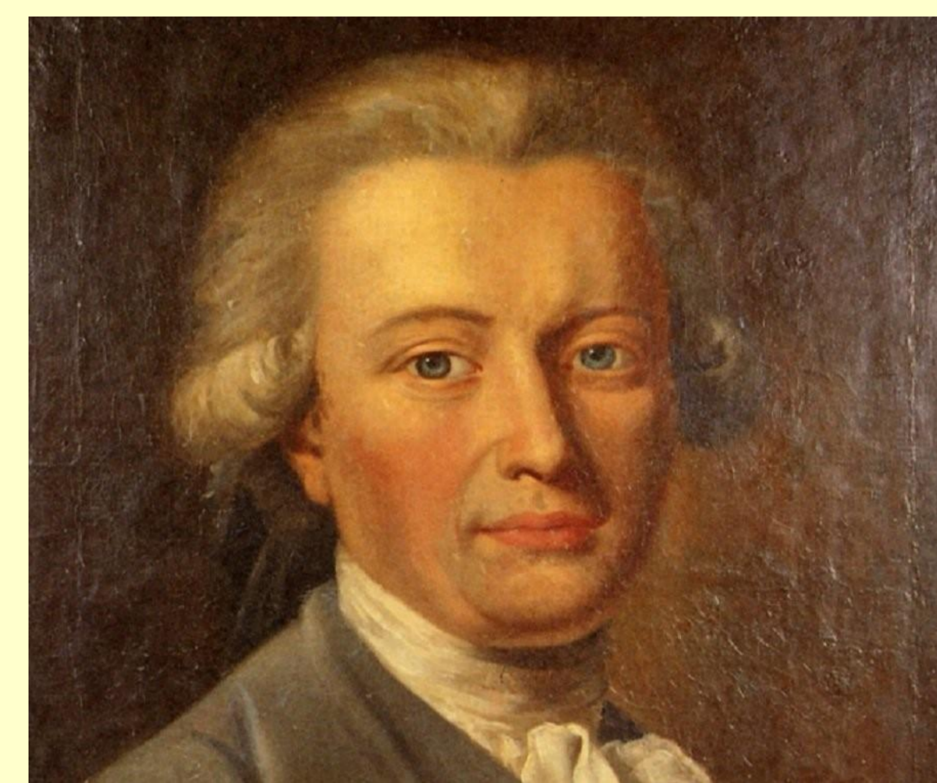
René Joachim Henri Dutrochet. 1776-1847