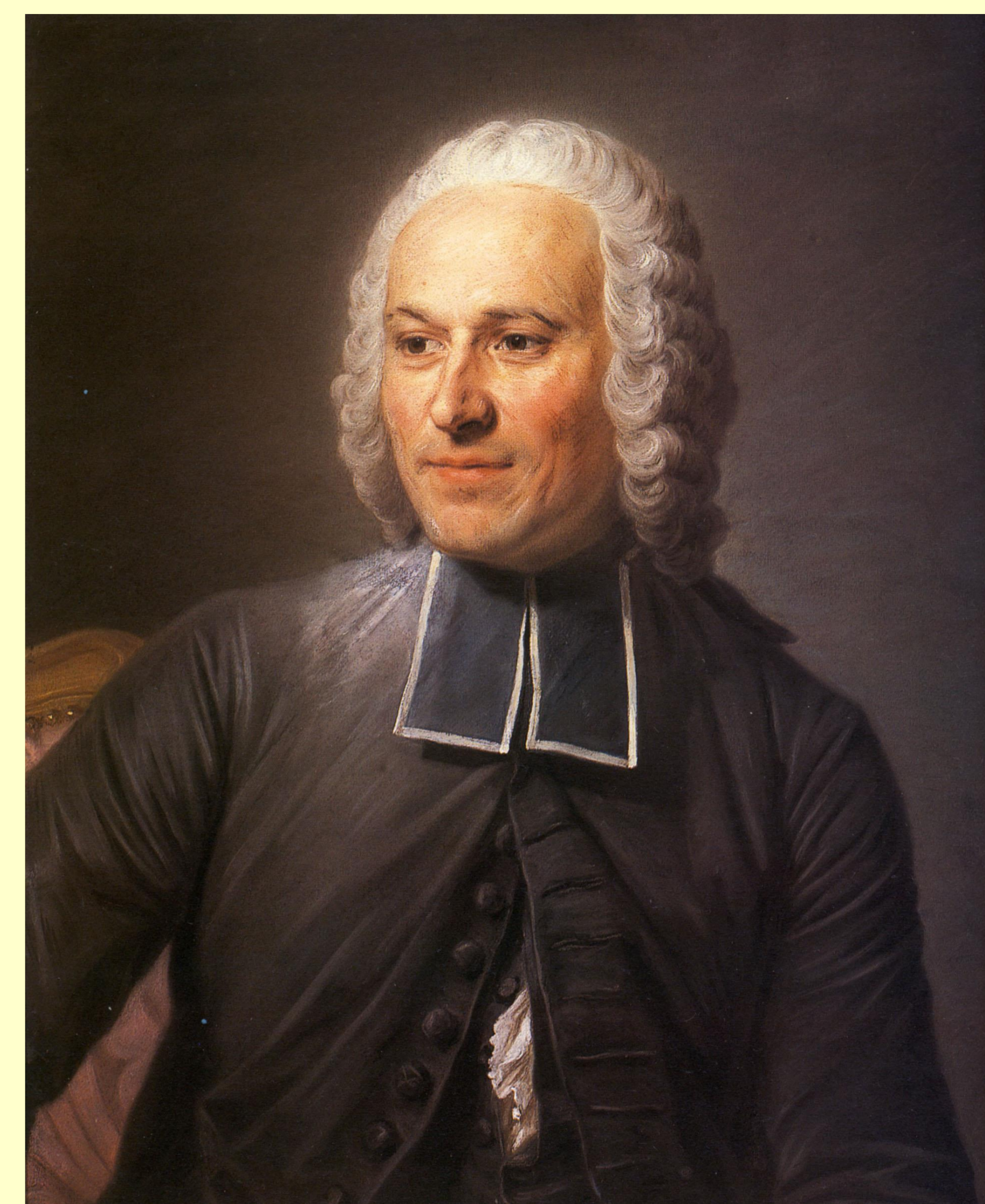
Jean-Antoine Nollet. 1700-1770

The so called “dialyzer”, used by Thomas Graham, is a far rudimentary forerunner of the modern devices routinely used in the dialysis machines today. In his article from 1861 Thomas Graham made one very interesting observation, which could be called prophetic: “...half a litre of urine, dialyzed for 24 hours, gave its crystalloid constituents to the external water. The latter, evaporated in a water-bath, yielded a white saline mass. From this mass, urea was extracted by alcohol in so pure a condition as to appear in crystalline tufts upon the evaporation of the alcohol.” There still remains around 50 years until the creation of the first dialysis machine (John Jacob Abel, (1913)) and experiments on dogs. But that is another story...